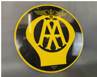
m261 AA, a double sided circular enamel sign marked Franco SW1 depicting AA Car Grille Badge, c18ins