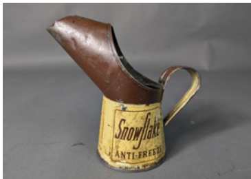
m159 Snowflake Anti-Freeze half pint pouter