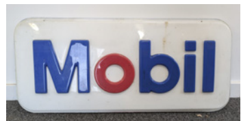
m7 Mobil, a moulded plastic garage forecourt sign, 49x22.5ins

All lots are sold strictly as seen and without warranty, potential purchasers must satisfy themselves as to the true condition of a lot by personal inspection prior to the sale.