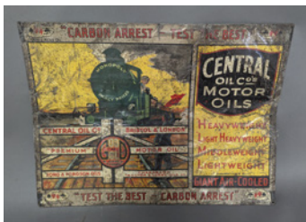
m272 Central Motor Oils Oil Co printed tin sign, an early and extremely uncommon survivor, 19x14.5ins