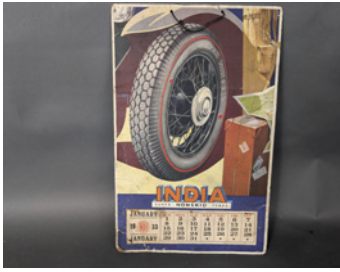
m191 India Tyres 1933 wall hanging card calendar with all month sheets intact, 15.5x10ins