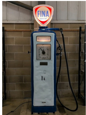
m623 Gilbarco petrol pump, restored, complete with genuine Fina Special globe standing an impressive 92ins tall