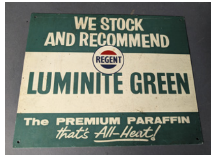
m151 Regent Luminite Green Paraffin single sided printed aluminium sign, 10x8ins