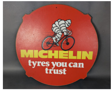
m138 Michelin Tyres You Can Trust single sided circular showcard 25ins diameter