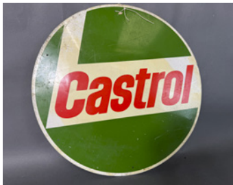
m260 Castrol circular single sided printed aluminium sign, c18ins dia'