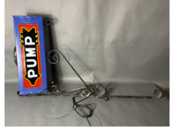
m48 'Pump' wall mounted illuminating sign/bracket to mount fuel pump globe