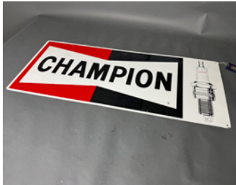
m626 Champion spark plugs pictorial aluminium sign 36x15ins