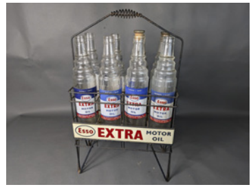
m100 Esso Extra Motor Oil bottle stand with double sided signage, complete with 8no. correct Esso Extra glass quart bottles