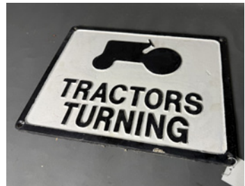
m638 Tractors Turning cast pre-Warboys road sign, no makers name evident c.19.5x15.5ins