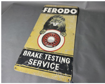
m625 Ferodo Brake Testing Service aluminium sign 36x18ins