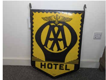
m5 AA Hotel a double sided hanging enamel sign consisting of 2 enamel signs in a frame, by Franco c.31.5x22ins