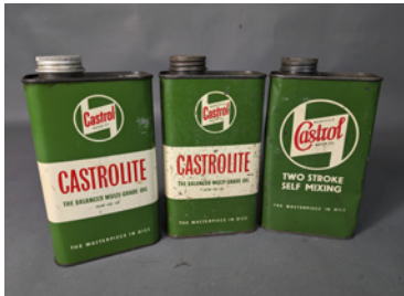
m171 3no. Castrol quart engine oil tins