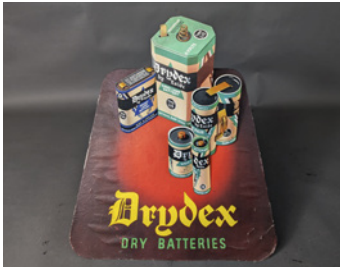
m192 Drydex Dry Batteries freestanding promotional showcard 14ins tall