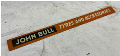
m345 John Bull Tyres and Accessories shelf-edge strip