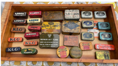
m578 Qty spark plug and repair tins contained in display case to inc. Sphinx, Holdite, Romac, Dunlop etc