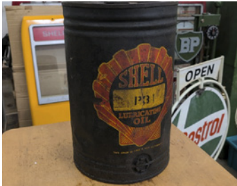
m606 Shell Lubricating Oil 5gallon can with original seal and cap