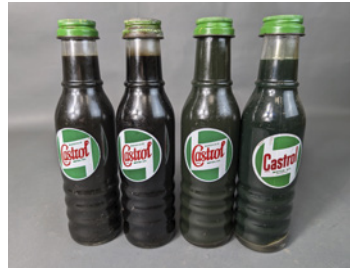
m187 4no. Castrol glass oil bottles, some Wakefield, with contents