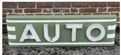
m352 Auto, a metal garage sign using original lettering but with re-purposed back

All lots are sold strictly as seen and without warranty, potential purchasers must satisfy themselves as to the true condition of a lot by personal inspection prior to the sale.