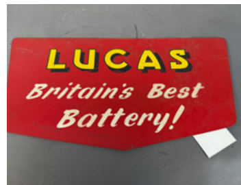
m603 Lucas Batteries display stand sign c.19x10ins

All lots are sold strictly as seen and without warranty, potential purchasers must satisfy themselves as to the true condition of a lot by personal inspection prior to the sale.