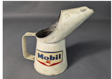
m163 Mobil pint oil pouter