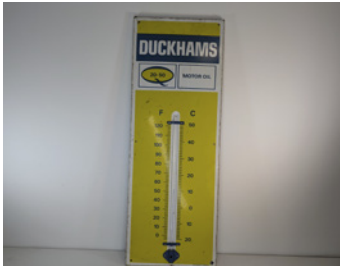
m2 Duckhams 20-50 Motor Oil wall mounted enamel sign with thermometer, 36x13ins