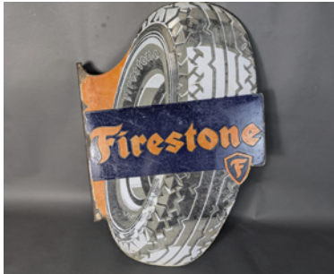
m136 Firestone double sided flanged enamel sign, c.26x17.5ins