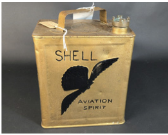
m584 Shell Aviation Spirit 2gallon petrol can, restored