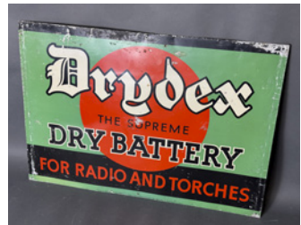
m50 Drydex For Radio & Torches single sided tin sign, 25x17.5ins

All lots are sold strictly as seen and without warranty, potential purchasers must satisfy themselves as to the true condition of a lot by personal inspection prior to the sale.