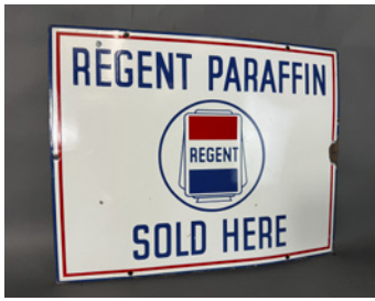
m258 Regent Paraffin Sold Here single sided enamel sign with pictorial globe, c18x14ins