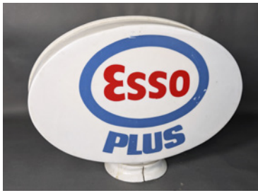
m153 Esso Plus plastic petrol pump globe