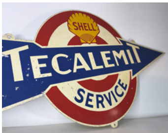
m304 Tecalemit Service aluminium arrow sign