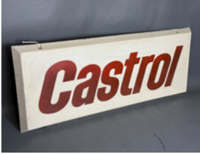
m52 Castrol Workshop wall mounted fibreglass sign, 36x14ins