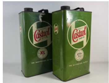
m276 2no. Castrol oil pint tinsm