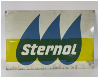
m296 Sternol printed single sided tin sign