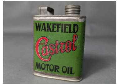
m179 Wakefield Castrol Motor Oil miniature promotional display can