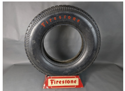
m134 Firestone promotional tyre stand complete with car tyre

All lots are sold strictly as seen and without warranty, potential purchasers must satisfy themselves as to the true condition of a lot by personal inspection prior to the sale.