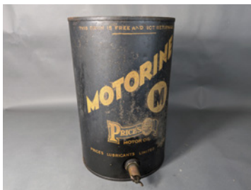
m99 Price's Motorine Motor Oil 5gallon can complete with Price's cap, tap and original label