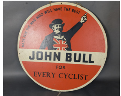
m139 John Bull for Every Cyclist single sided circular showcard 23.5ins diameter