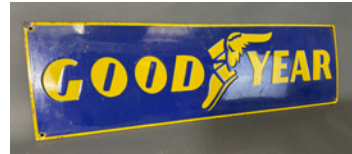
m263 Goodyear single sided enamel sign, c24x7ins