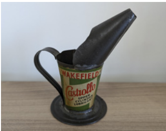
m45 Castrollo Upper Cylinder Lubricant pouring jug