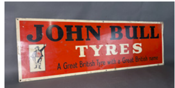
m255 John Bull Tyres single sided printed aluminium sign marked Franco SW1, c36x12ins