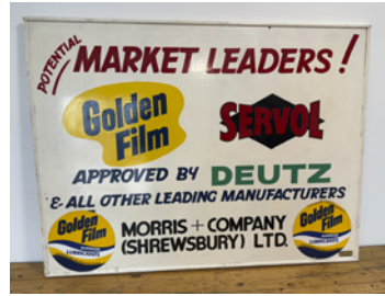
m514 Morris Golden Film hand painted advertising sign by Roystan John Signwriters, Exeter