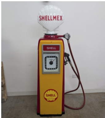
m241 Shell liveried Avery-Hardoll petrol pump together, subject to a high quality restoration, complete with reproduction glass globe and 4star delivery hoses