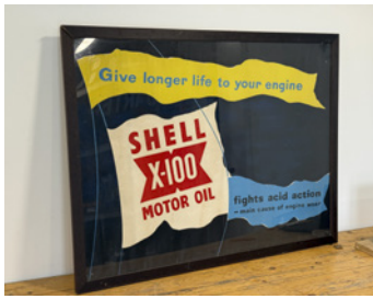
m506 Shell X-100 large framed and glazed advertising poster 42.5x32.5ins overall