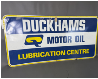
m604 Duckhams Lubrication Centre metal sign c59x29.5ins