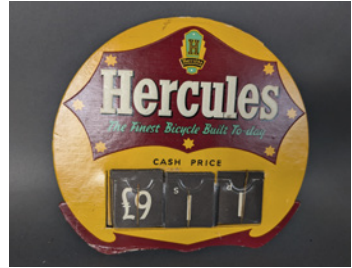
m195 Hercules The Finest Bicycle Built To-Day wall hanging cash price indicator with price tabs