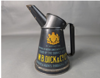
m183 ILO W.B. Dick & Co. Ltd quart oil pouter