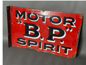
m64 Motor BP Spirit double sided flanged enamel sign, 24x15ins