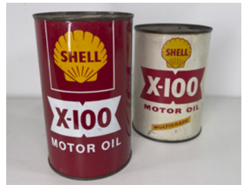
m274 2no. Shell X-100 oil tins