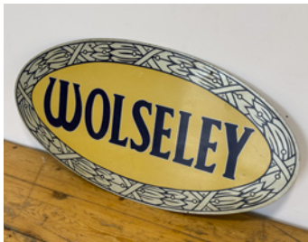
m509 Wolseley double sided printed tin sign