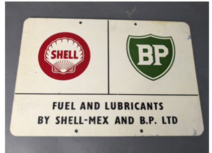
m150 Shell BP Fuel and Lubricants single sided printed aluminium sign, 12x8ins