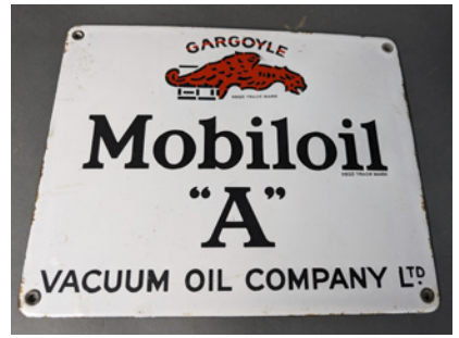
m147 Mobiloil 'A' oil single sided enamel sign, 11x9ins