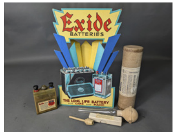
m190 Exide Batteries The Long Life Battery For Cars and Radio freestanding promotional showcard 14.5ins tall, t/w battery and N.O.S hydrometer

All lots are sold strictly as seen and without warranty, potential purchasers must satisfy themselves as to the true condition of a lot by personal inspection prior to the sale.