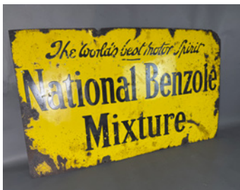
m253 National Benzole Mixture, The World's Best Motor Spirit single sided enamel sign, c40x24ins