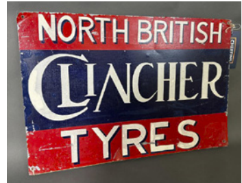
m580 Clincher Tyres single sided printed tin sign with hardboard backing, some restoration 24x16ins