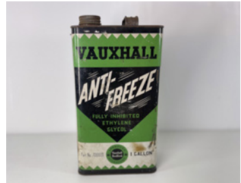
m306 Vauxhall anti-freeze 1gallon can