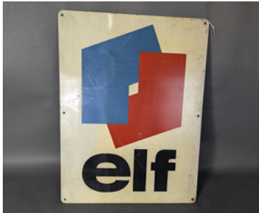
m143 Elf single sided printed aluminium sign, 24x18ins