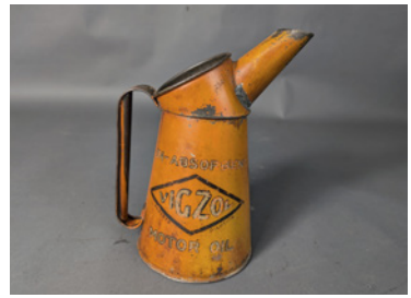
m161 Vigzol Motor Oil quart pouter