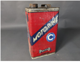
m118 Price's Motorine C 1gallon oil can