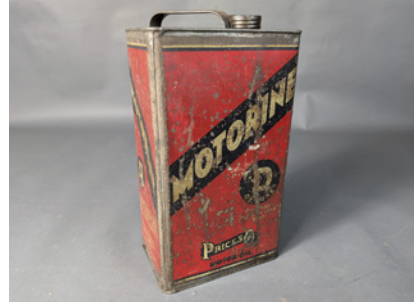
m130 Price's Motorine D De Luxe 1gallon oil can with contents