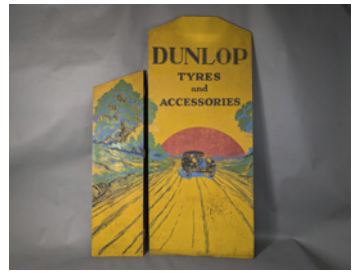
m273 Dunlop Tyres and Accessories painted pictorial plyboard sign c/w one wing, stands 55ins tall