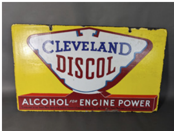
m96 Cleveland Discol Alcohol For Engine Power double sided hanging enamel sign, 18x30ins