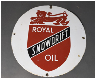
m146 Royal Snowdrift Oil circular single sided enamel sign, 12ins diameter