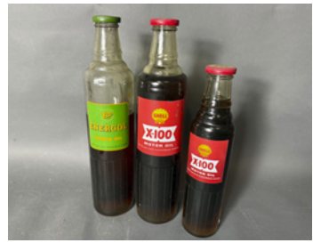
m630 3no. glass oil bottles to inc. BP Energol and Shell X-100