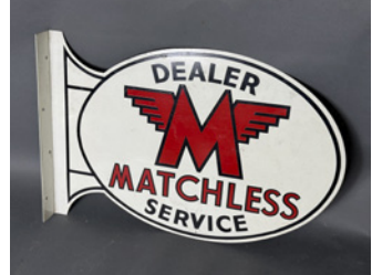
m49 Matchless Dealer flanged double sided printed tin sign, 19x13ins