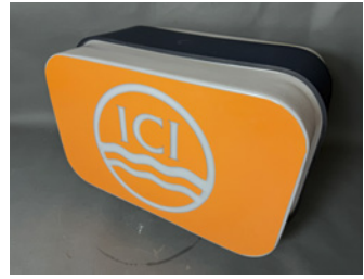
m47 ICI 3piece plastic petrol pump globe, comprised of 2 panels and a plastic centre