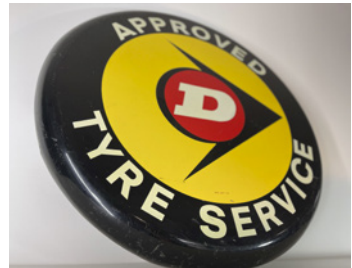
m307 Approved Dunlop Tyre Service circular sign