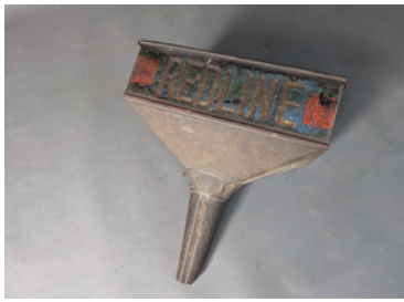
m169 Redline embossed fuel funnel