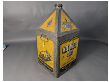
m88 Notwen Oil For Dependability 5gallon pyramid top can