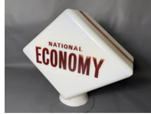
m63 National Economy glass petrol pump globe