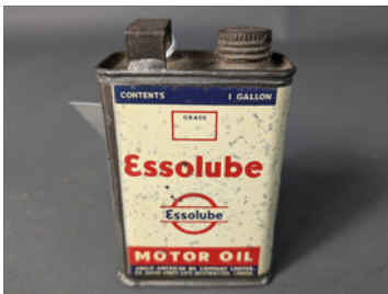
m86 Uncommon Essolube miniature display promotional oil can marked "1 gallon" c.4.5ins tall