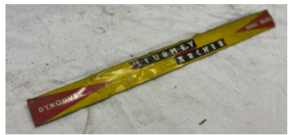
m347 Sturmey Archer shelf-edge strip