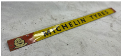
m346 Michelin Tyres shelf-edge strip