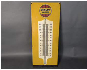
m239 Dunlop Stock tin sign with remains of thermometer, 24x9.5ins