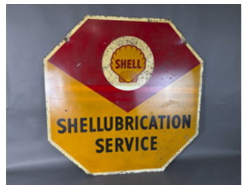
m249 Shelllubrication, an octagonal single sided printed aluminium sign, c34ins x 34ins

All lots are sold strictly as seen and without warranty, potential purchasers must satisfy themselves as to the true condition of a lot by personal inspection prior to the sale.