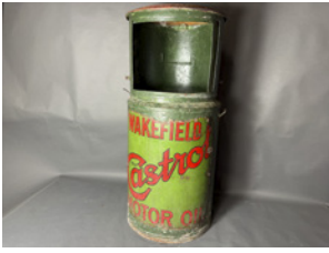
m51 Wakefield Castrol Motor Oil dispenser cabinet fitted with original enamel sign