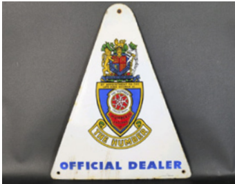
m574 The Humber Official Dealer triangular enamel sign 14x11.5ins