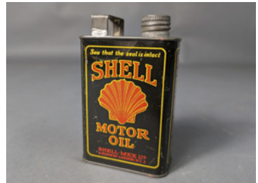
m180 Shell Motor Oil miniature black promotional display can, a rare item