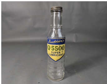
m184 Duckham's Q5500 Super Lubricant glass oil bottle, very uncommon