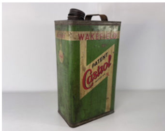
m301 Early Wakefield Castrol 1gallon oil can