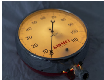
m348 Kismet BB MK1 110lb wall mounted illuminated air gauge c/w PCL MK3 airline and gauge