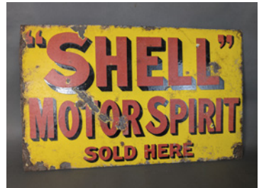
m92 'Shell' Motor Spirit Sold Here double sided enamel sign, flange removed, 21x13ins