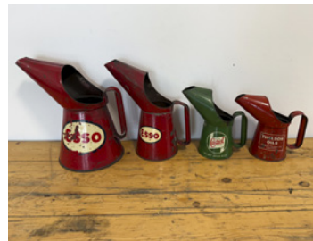
m515 4no. Oil pourers to inc' Castrol, Esso, Thelson, various sizes