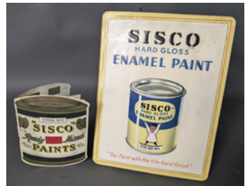
m196 Sisco Hard Gloss Enamel Paint freestanding showcard 10.5x8ins t/w Sisco Paints sample booklet