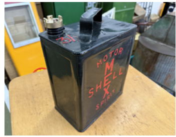
m617 Mex B 2gallon petrol can