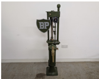
m242 BP liveried Bowser skeleton petrol pump, restored