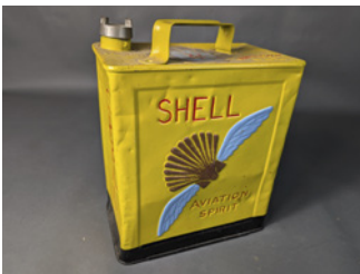
m125 Shell Aviation Spirit 2gallon petrol can with Shell cap, restored