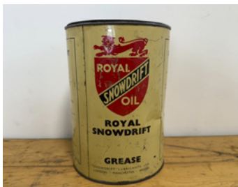
m511 Royal Snowdrift Oil 5lb grease tin