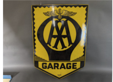
m89 AA Garage single sided shield shaped enamel sign by Franco, 30.5x22ins