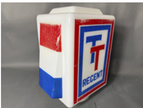
m55 Regent TT glass petrol pump globe, marked Hailware British Made to bottom