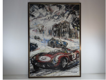
m4 'The Race' an oil on canvas depicting Behra, Moss and Gregory at Le Mans 1959 by F.Scianna, c.40.5x28.5ins inc. frame