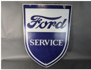
m94 Ford Service double sided shield shaped hanging enamel sign 33x23.5ins