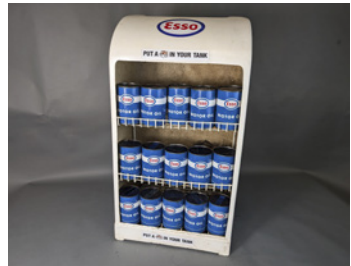
m189 Esso forecourt oil can stand complete with 15no. Esso Motor Oil pint cans