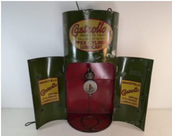
m44 Castrollo Upper Cylinder Lubricant wall hanging dispensing cabinet with optic, made by H.P.C & Co. Ltd with good decals and enamel signs on both doors, showing signs of minor older restoration