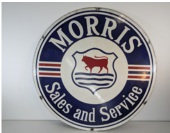
m3 Morris Sales and Service circular enamel sign, 28.5ins diameter