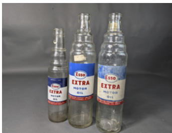
m185 Pr. Esso Extra Motor Oil glass bottles t/w a pint version