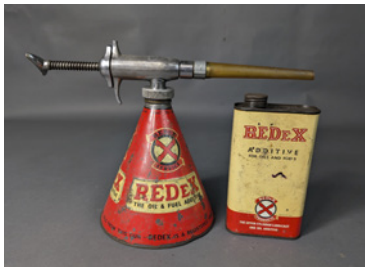
m156 Redex hand held dispenser t/w pint tin