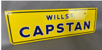
m267 Wills's Capstan single sided enamel sign, c28x9ins