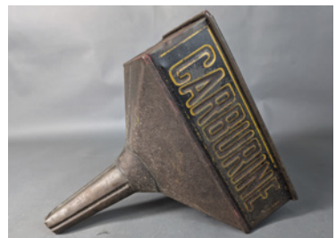
m168 Carburine embossed fuel funnel