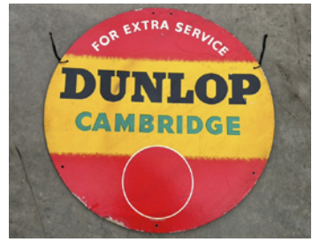
m579 Dunlop Cambridge cycle tyres circular show card c.23.5ins dia'