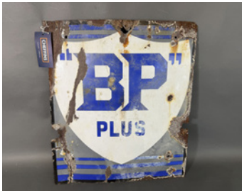
m586 BP Plus enamel sign, losses, 24x21ins