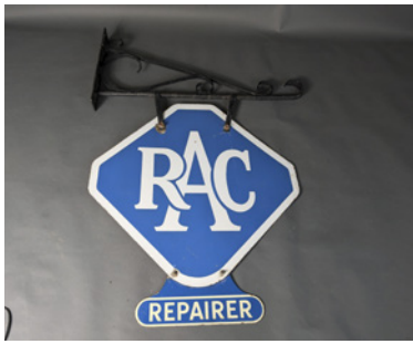
m135 RAC Repairer diamond shape double sided enamel sign complete with lozenge and hanging bracket