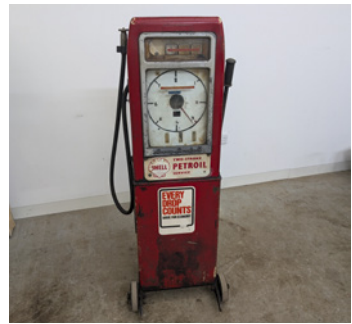
m243 Avery-Hardoll Two-Stroke Petrol Service mobile petrol pump, clock face has been hand drawn, complete with nameplate