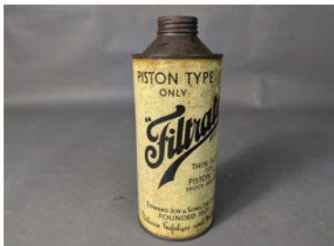
m176 Filtrate Thin Fluid for Piston Type Shock Absorbers oil can, approx. 1quart