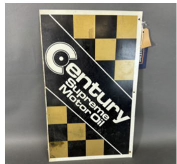
m583 Century Supreme Motor Oil tin sign, c.21.5x13ins

All lots are sold strictly as seen and without warranty, potential purchasers must satisfy themselves as to the true condition of a lot by personal inspection prior to the sale.