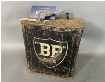
m587 BP Plus 2gallon petrol can