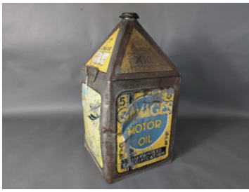
m76 Gamages Motor Oil Grade XXL pyramid top can