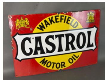
m265 Wakefield Castrol Motor Oil double crest single sided enamel sign, marked Bruton, Palmers Green, c30x24ins