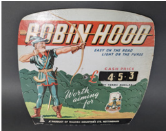
m193 Robin Hood Raleigh Bicycles card price display card with spinner to adjust price 9x9.5ins