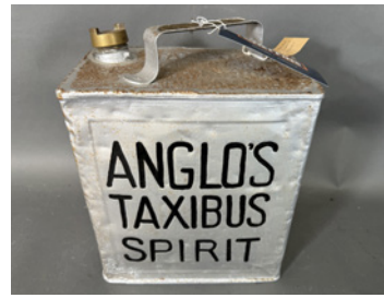
m593 Anglos Taxibus Spirit 2gallon petrol can with correct cap