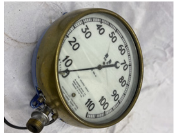
m349 William Turner Kismet BB MK3 wall mounted illuminated air gauge t/w air line and Stenor gauge