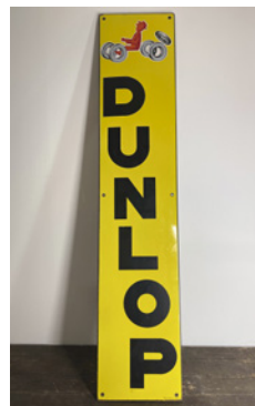
m308 Vertical Dunlop French enamel sign

All lots are sold strictly as seen and without warranty, potential purchasers must satisfy themselves as to the true condition of a lot by personal inspection prior to the sale.