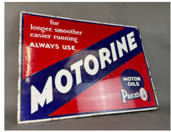
m254 Prices Motorine double sided flanged enamel sign, great gloss, marked Bruton Palmers Green, c24x18ins