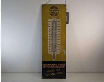
m1 Dunlop Stock wall hanging tin sign with thermometer, 30x10ins

Please refer to foreword re: Buyer's Premium, VAT, Lot Collection and Method of Payment.