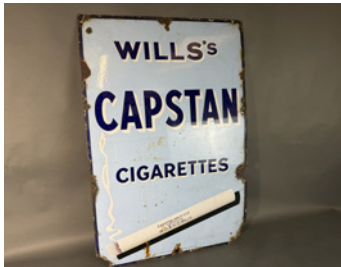
m252 Will's Capstan Cigarettes single sided pictorial enamel sign, c36x24ins