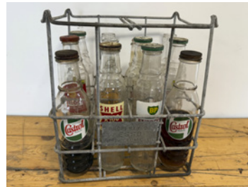
m517 Esso Petroleum Co metal oil bottle crated c/w 12no. Oil bottles to inc' Castrol, Shell, Glico etc

All lots are sold strictly as seen and without warranty, potential purchasers must satisfy themselves as to the true condition of a lot by personal inspection prior to the sale.