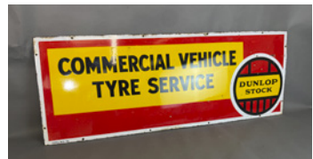
m256 Dunlop Stock Commercial Vehicle Tyre Service single sided enamel sign, c48x18ins