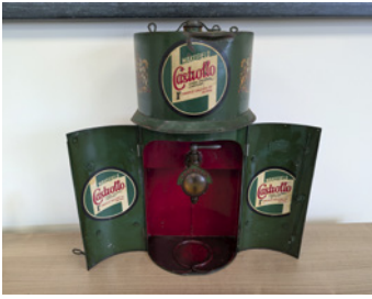
m43 Castrollo Upper Cylinder Lubricant wall hanging dispensing cabinet with optic, made by H.P. Co. Ltd with good decals and enamel signs on both doors, showing signs of older restoration