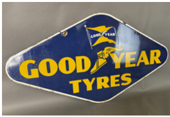
m266 Goodyear Tyres double sided enamel sign of penant form, c36x19ins