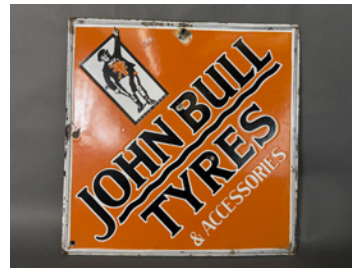
m264 John Bull Tyres & Accessories double sided enamel sign of diamond form with bevelled edges, c15.5x15.5ins