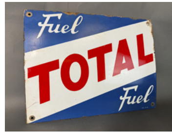
m262 Total Fuel single sided enamel sign, c20x15ins