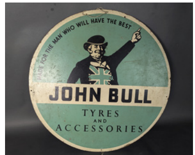
m140 John Bull Tyres and Accessories single sided circular showcard 23.5ins diameter