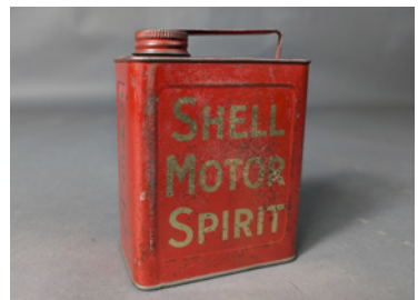
m181 Shell Motor Spirit miniature display petrol can to suit pedal car etc

All lots are sold strictly as seen and without warranty, potential purchasers must satisfy themselves as to the true condition of a lot by personal inspection prior to the sale.