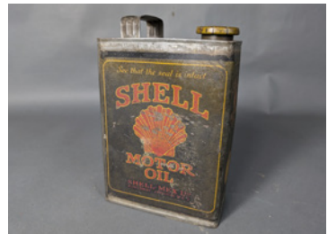
m102 Shell Motor Oil can, embossed Shell-Mex Ltd, size not indicated, c.1 quart