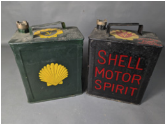
m120 2no. Shell Motor Spirit 2gallon petrol cans with Shell caps, restored