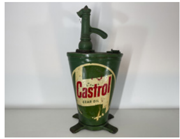
m305 Castrol gear oil dispenser