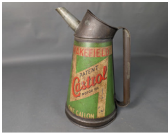
m182 Wakefield Castrol Motor Oil One Gallon oil pouter