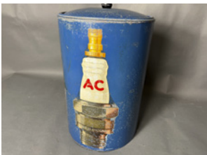
m56 AC Sparkplugs counter top display cabinet