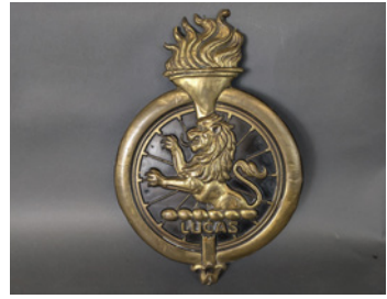
m194 Lucas lion wall or cabinet mounted trademark logo, celluloid construction to appear as brass 13.5ins tall