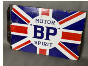
m66 BP Motor Spirit Union Jack double sided flanged enamel sign, 24x16ins