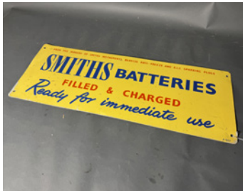
m628 Smiths Batteries Filled & Charged Ready For Immediate Use aluminium sign 31x11.5ins