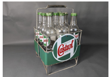
m105 Castrol Motor Oil bottle stand with double sided enamel signs, complete with 9no. glass Castrol quart bottles with caps

All lots are sold strictly as seen and without warranty, potential purchasers must satisfy themselves as to the true condition of a lot by personal inspection prior to the sale.