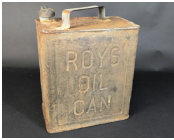
m573 Roys Oil early 20th century 2gallon can