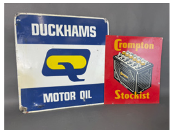
m257 Duckhams Motor Oil and Crompton Stockist single sided printed aluminium signs

All lots are sold strictly as seen and without warranty, potential purchasers must satisfy themselves as to the true condition of a lot by personal inspection prior to the sale.